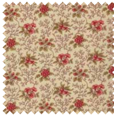
№ 44026 16* Linen