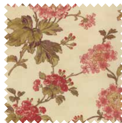
No 44022 16* Linen