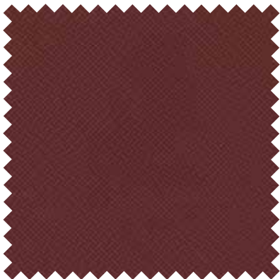
No 44028 12 Burgundy