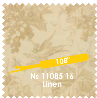
No 11085 16 Linen

While touring the numerous chateaus, the Sisters also added a variety of ornate vintage wine labels to their collection. In delicious shades of the finest wines, this sophisticated collection is sure to please the most discerning of palettes.