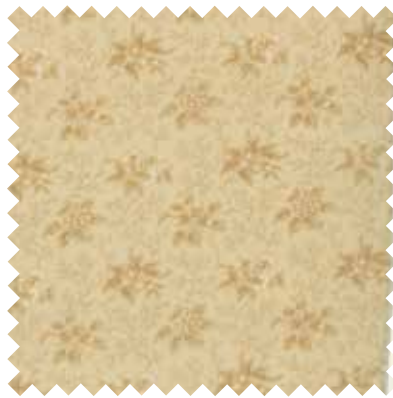
№ 44026 26 Linen