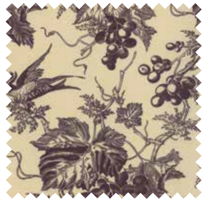
No 44021 21 Linen Grape