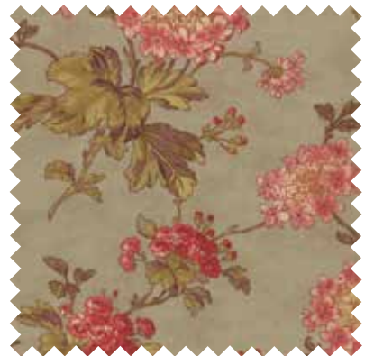
No 44022 15 Stone