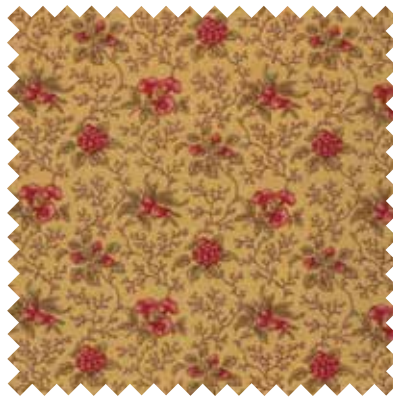
№ 44026 13* Champagne