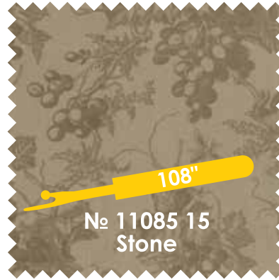
No 44021 15 Stone