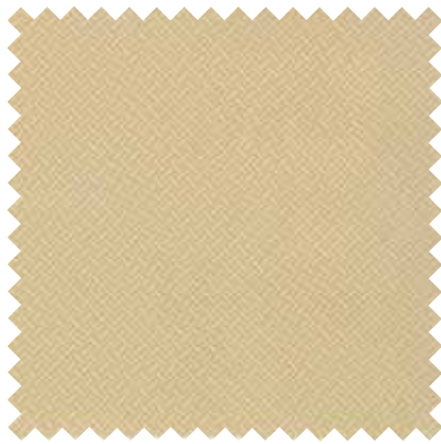
No 44028 16 Linen