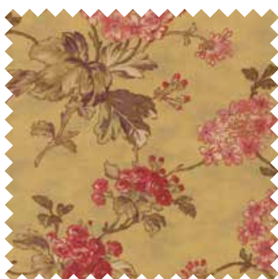
No 44022 13 Champagne