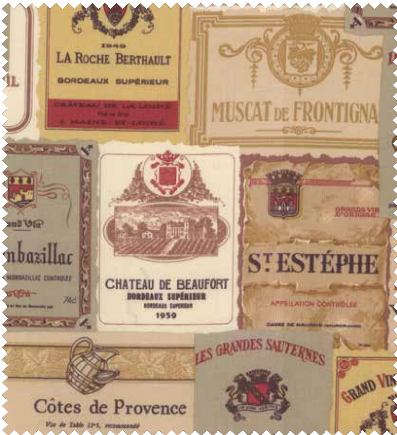
No 44020 11* Multi