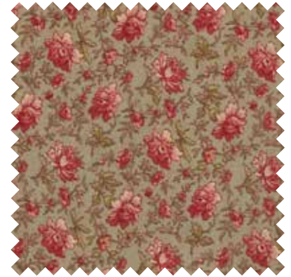
No 44024 15* Stone