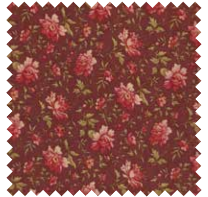
No 44024 12* Burgundy