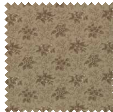
No 44026 25 Stone