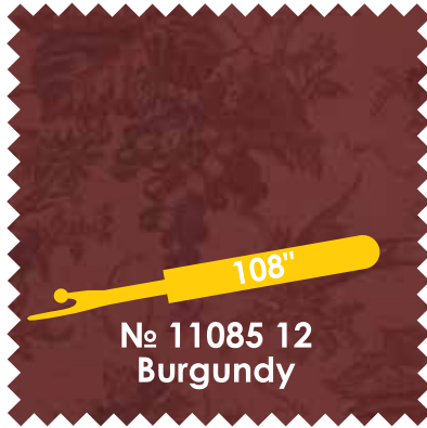
No 11085 12 Burgundy