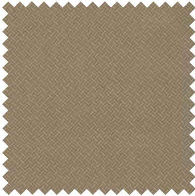
No 44028 15* Stone