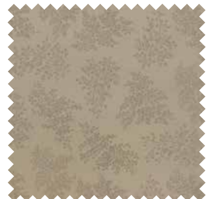
No 44027 25* Stone