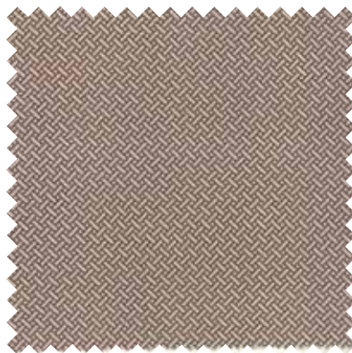
№ 44028 21 Linen Grape