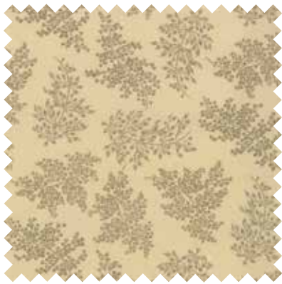
No 44027 15 Stone