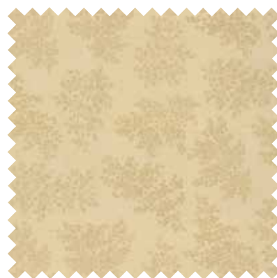
No 44027 16* Champagne