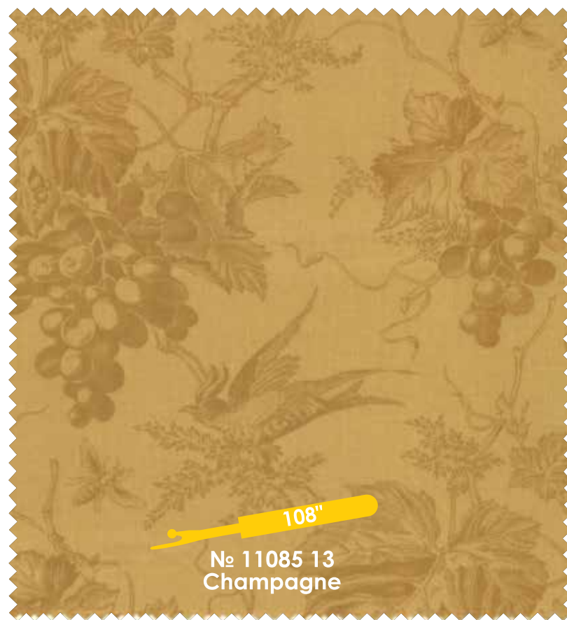
No 11085 13 Champagne