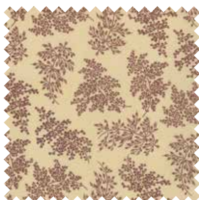
No 44027 12 Burgundy