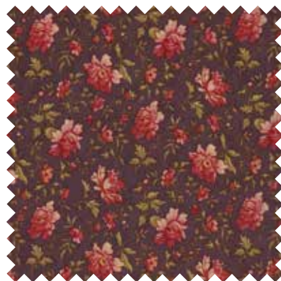
No 44024 11* Grape