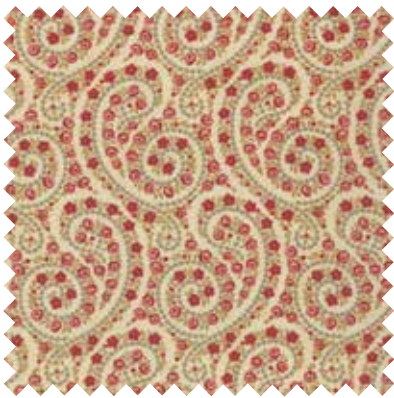
№ 44025 16 Linen