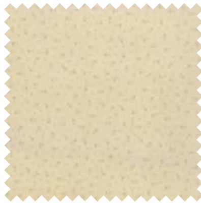
No 44029 16 Linen