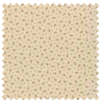
No 44029 12* Burgundy