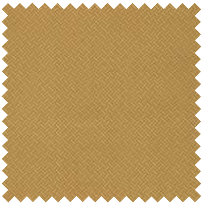
№ 44028 13 Champagne