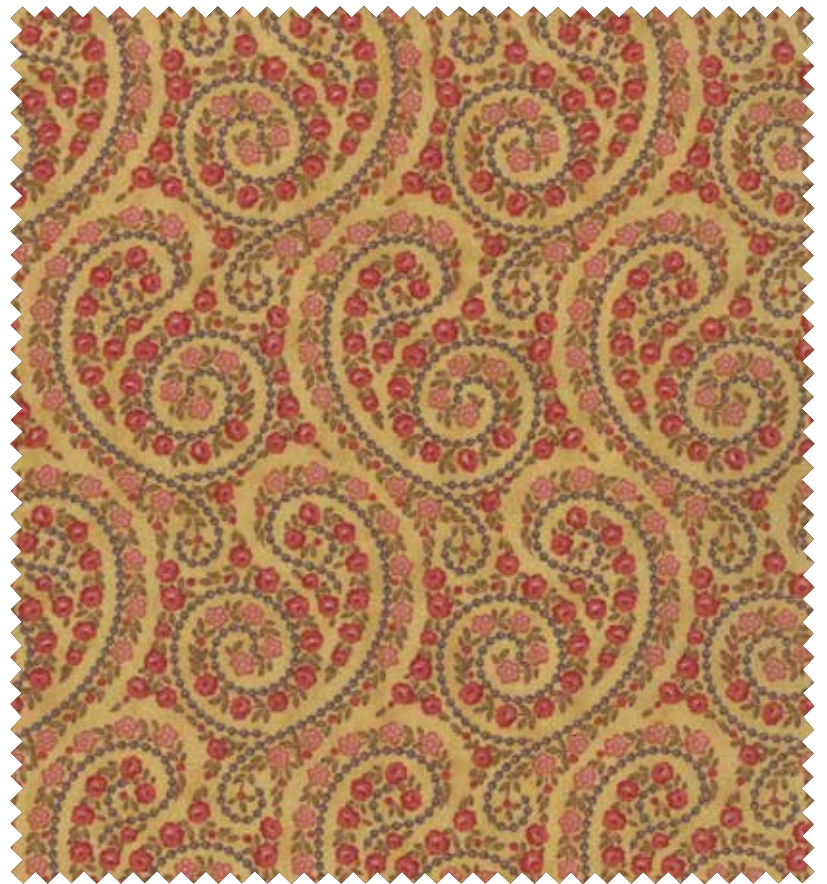
№ 44021 16* Linen