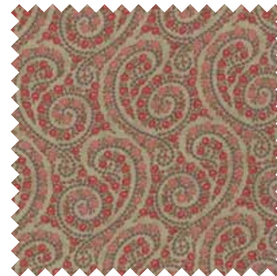
No 44025 15* Stone