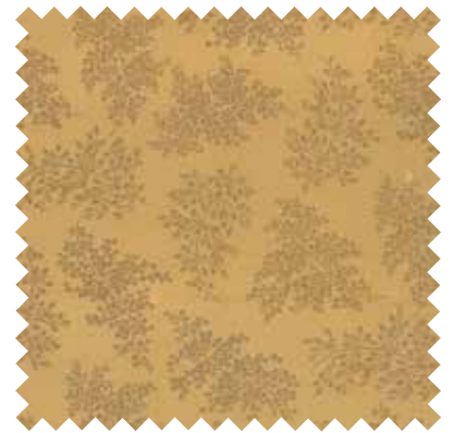
№ 44027 23* Linen