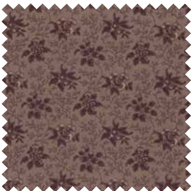
№ 44026 21 Grape