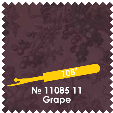
No 11085 11 Grape