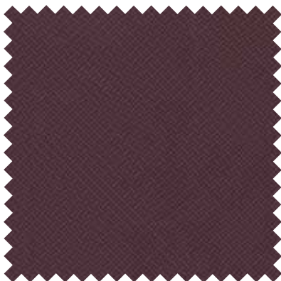
No 44028 11 Grape