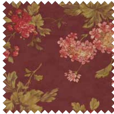
No 44022 12* Burgundy