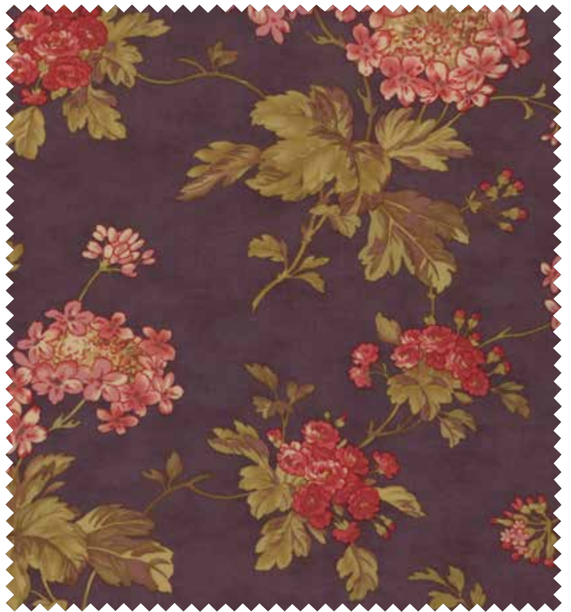
No 44022 11* Grape