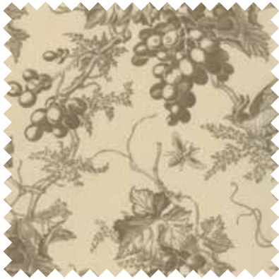
No 44021 25 Linen Stone