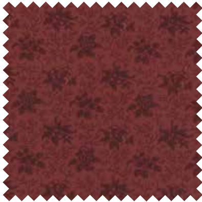
No 44026 22 Burgundy