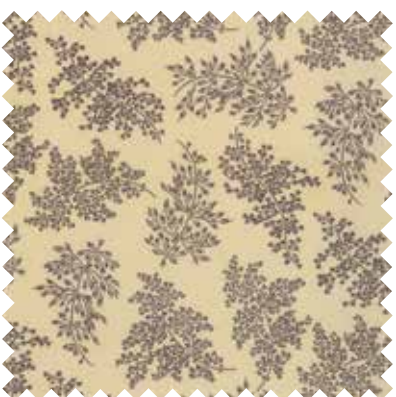
No 44027 11 Grape