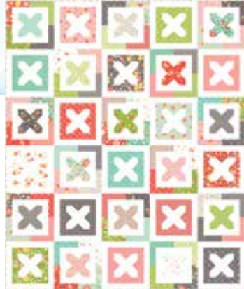
CQ 121 / CQ 121G Tansy Size: 60" x 72"