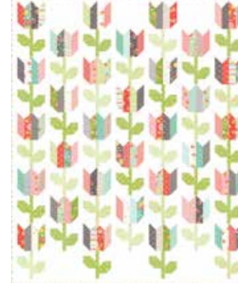
CQ 119 / CQ 119G Tulip Market Size: 68" x 83"