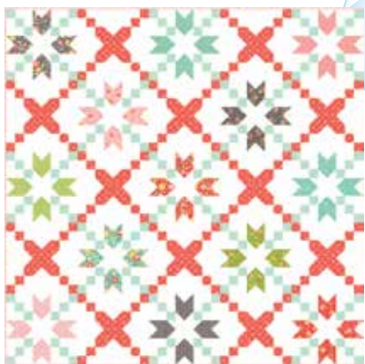
CQ 123 / CQ 123G Cross Stitch Size: 80" x 80"