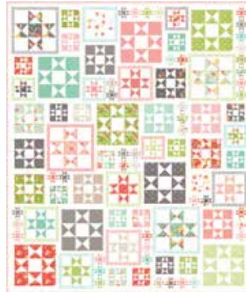
CQ 118 / CQ 118G Line Dried Size: 62" x 74"