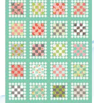
CQ 120 / CQ 120G Rummage Sale Size: 58" x 72"