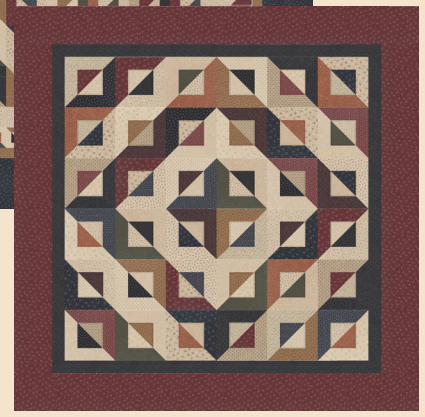
70" x 70" LC & PP Friendly Additional sizes & colorways available