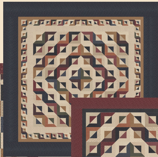
KT 22138 Back to the Barn Layered Patchwork King Size 104" x 104" LC & PP Friendly