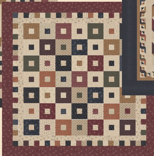
KT 55149 Framed 29" x 29" PP Friendly